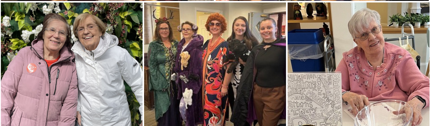
Clockwise from top left: Residents and Family at SLC Holiday Party, Cinco De Mayo Celebration Luncheon, Tower Hill Botanic Garden Orchid Exhibit, SLC staff dressed up for Halloween, Poetry Writing Workshop