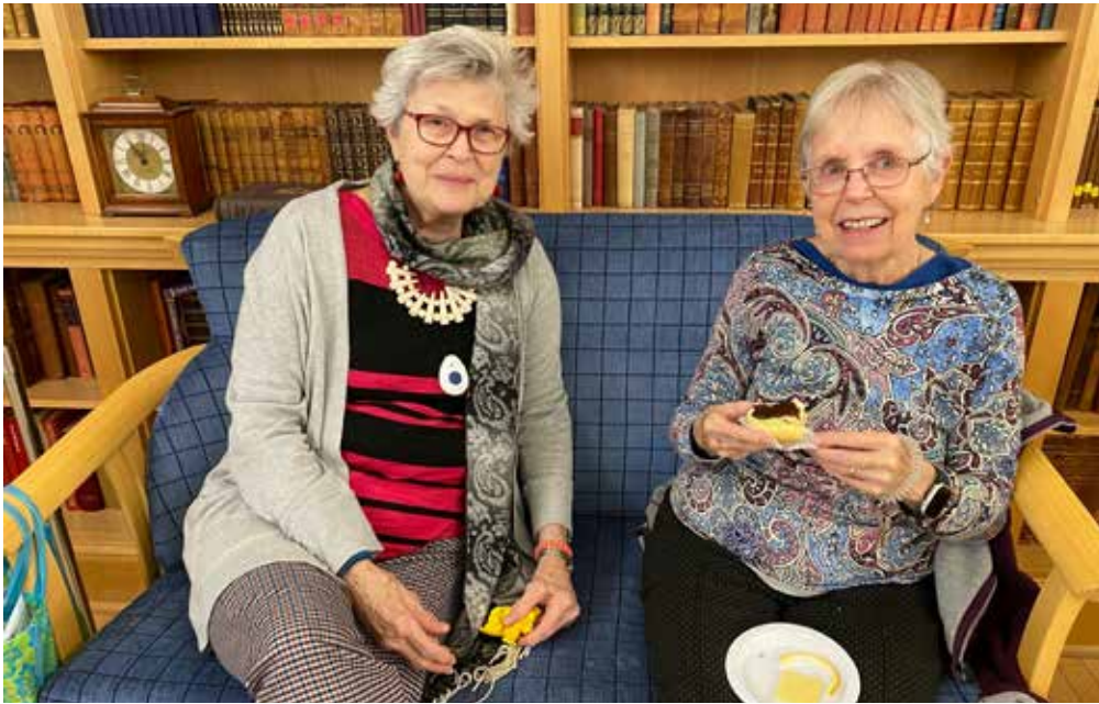
SOCIALIZING in the kaffestuga!

TAKE A LOOK AT OUR ROBUST COMMUNITY PROGRAMMING where neighbors from all around continue to enjoy the interactions made possible by the many different spaces, inside, outside, and virtually.