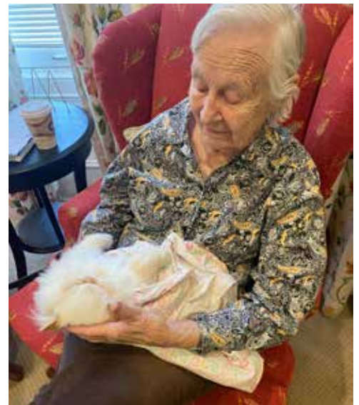
A VISIT from Barn Babies Traveling Petting Zoo.