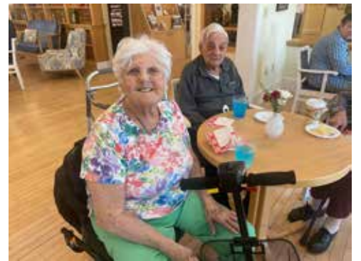
HAVING FUN at Happy Hour!