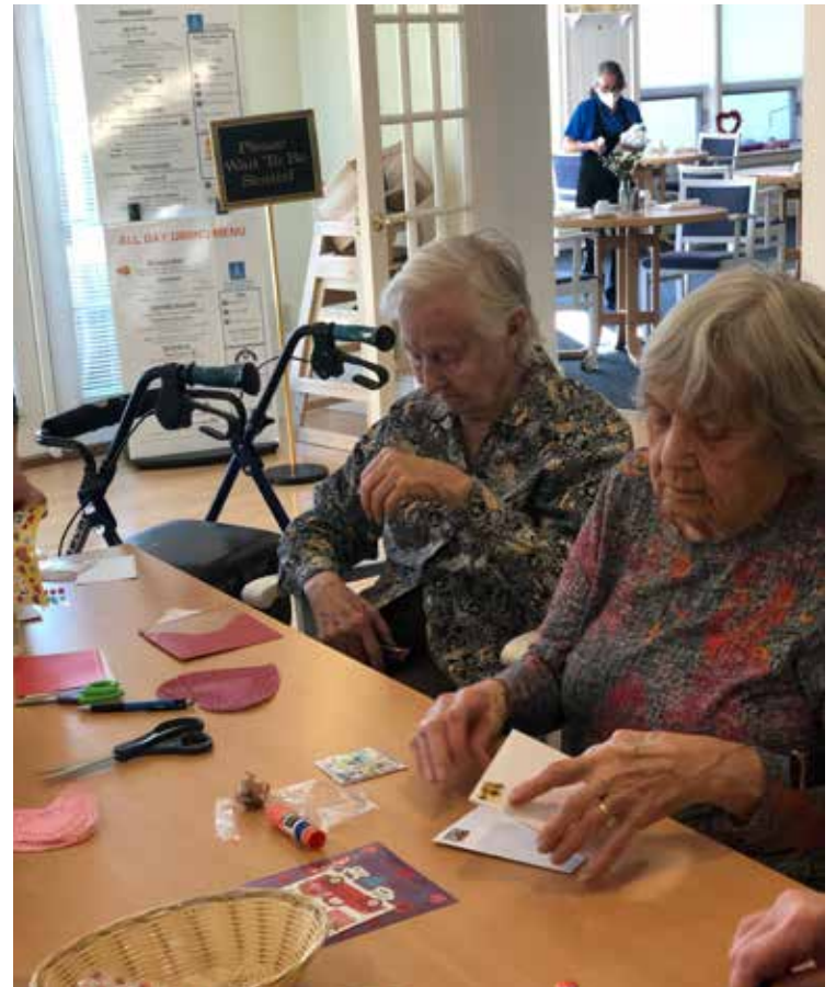
MAKING VALENTINE'S cards!