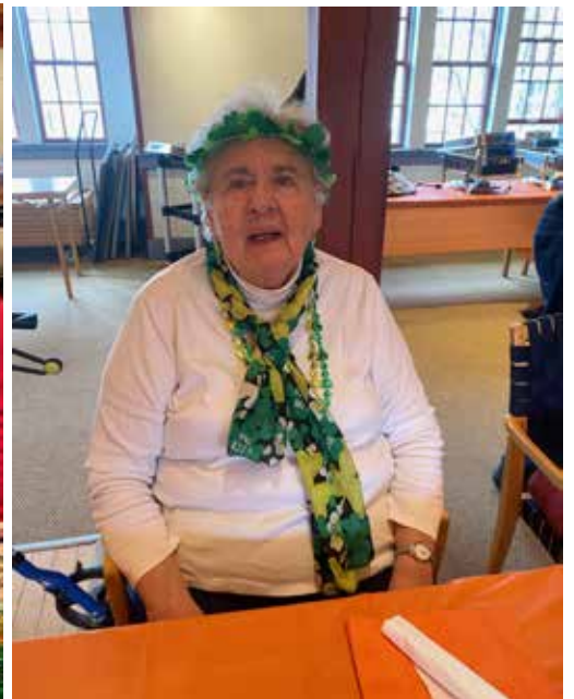
A DELICIOUS ST. PATRICK'S DAY Social! (3 photos)