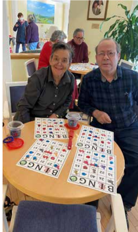
A FUN GAME of Bingo!