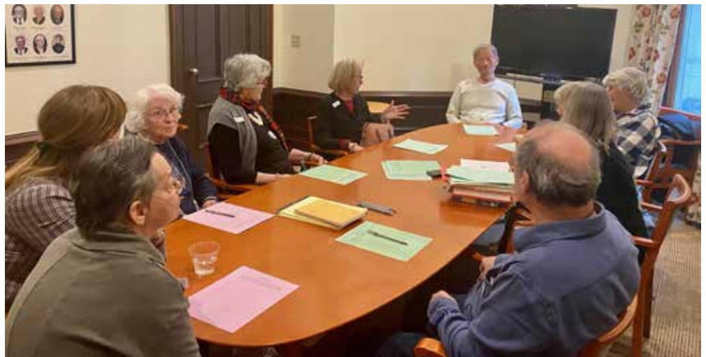
POETRY writing class!