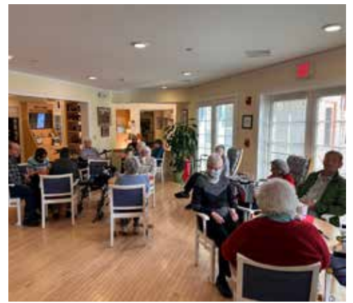
A COZY hot chocolate social!